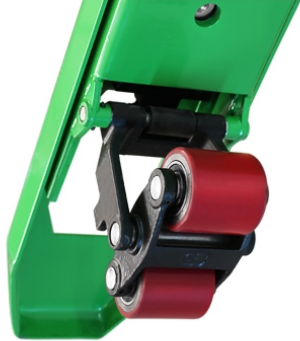
Closed Forks underside, for a higher protection against dirt.